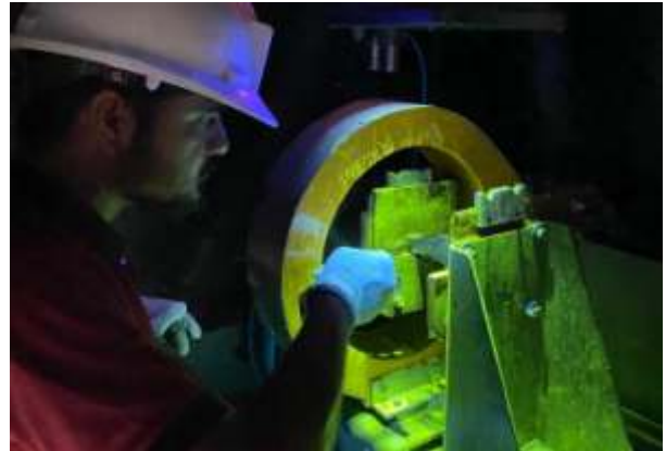
Electromagnetic Crack Detector