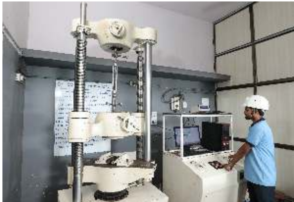
Universal Testing Machine (UTM)