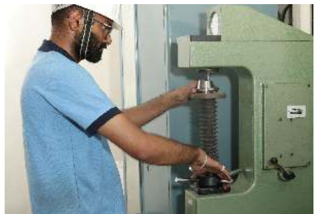
Brinell Hardness Tester