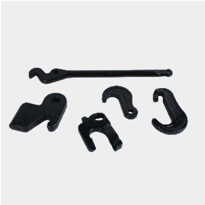
AUTOMOTIVE & LIFTING EQUIPMENT